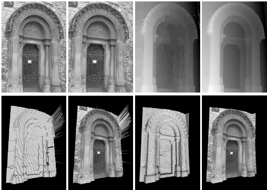
Figure 3: First row, from left to right: Left image of the 'Portal' image pair (greyscale version, cropped and resized to 435 \times 615 pixels to remove a black border stemming from the rectification). Right image. Disparity magnitude for GC approach [13] ( \lambda = 6 , automatically estimated). Same for our method ( \alpha = 40 , \sigma_{pre} = 0.5 , \gamma = 3 , \sigma = 2.5 , \rho = 5 , L = 97 ). Second row, from left to right: Reconstruction using GC approach. Same with texture mapping. Reconstruction using our method. Same with texture mapping.